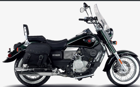
Emerald Green / Black