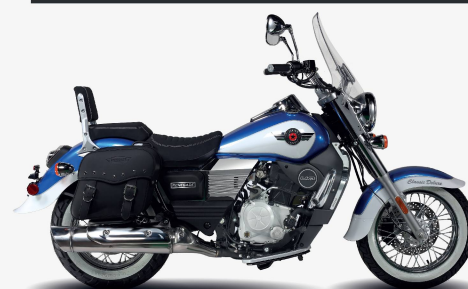
Blue / White